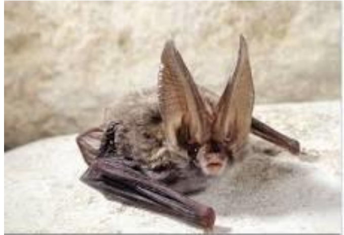
Rafinesque's Big-Eared Bat.

The Trinity River National Wildlife Refuge is the summer home of one of the most elegant and beautiful hawks in America, the Swallow-Tailed Kite . Also, the TRNWR is the year-round home of the largest-known Texas colony of the amazing Rafinesque's Big-Eared Bat .